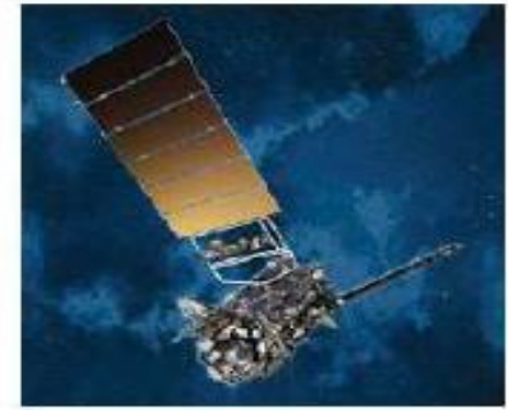
GOES-R NOAA Weather Lockheed Martin M2 Thermostat