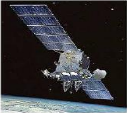
Advanced Extremely High Frequency (AEHF) Military Com Satellite Northrop Grumman M1 Thermostat