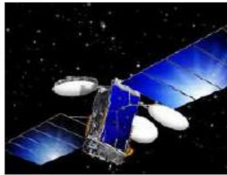
JCSAT-9 / JCSAT-10 Japan / Asia Telecom Lockheed Martin M2 Thermostat