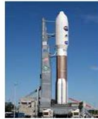
Atlas V Rocket Payload Launcher United Launch Alliance M1 Thermostat