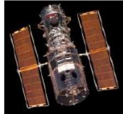
Hubble Space Telescope Space Exploration Lockheed Martin M2 Thermostat