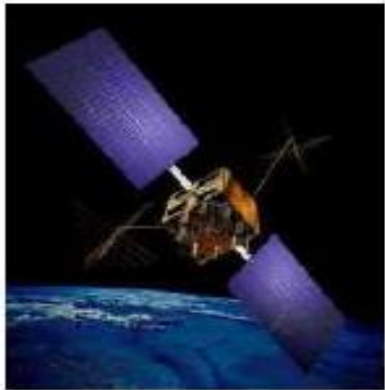
GPS III Global Positioning Lockheed Martin M2 Thermostat