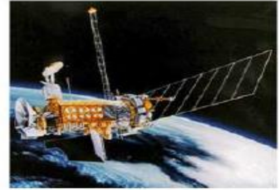
Defense Meteorological Space Program (DMSP) Military Weather Satellite Lockheed Martin M2 Thermostat