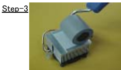
Step-3 Roll twice on the film to attach to heatsink