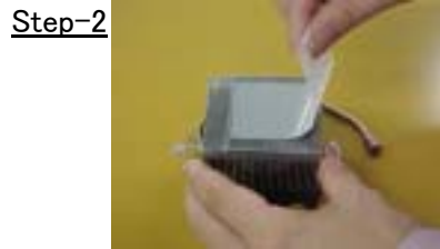
Step-2 Apply onto heatsink