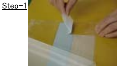
Step-1 Peel the product with carrier film off from PET film