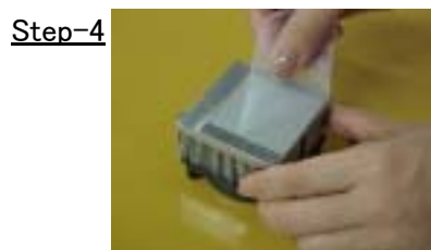
Step-4 Peel off instantly the PET film to 180°direction