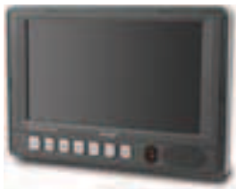
BE-870FM - Multi-image 7" LCD monitor