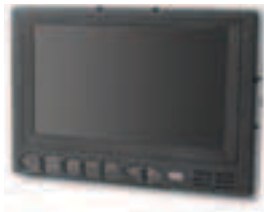
BE-970FM - Waterproof 7" LCD monitor